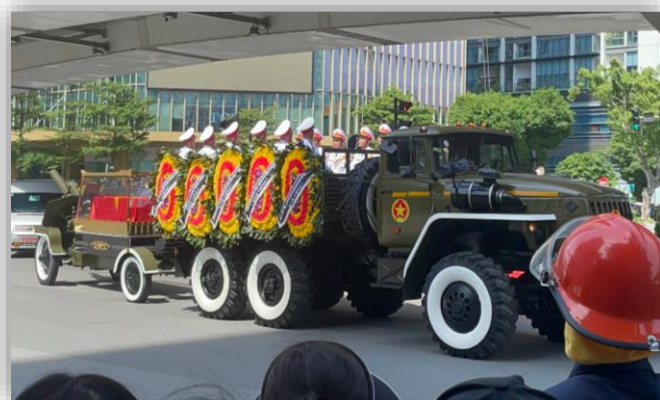
His coffin being transported to the cemetery

The funeral was attended by Communist Party officials including President To Lam and international dignitaries such as former Japanese Prime Minister Yoshihide Suga. The ceremony was open to the public, allowing citizens to pay their respects, and many waited in line into the late night. After the ceremony, traffic regulations were enforced to transport the body from the venue to Mai Dich cemetery, with thousands of citizens gathering along the route. Some mourners were seen crying and expressing their gratitude upon seeing Trong's coffin, highlighting the deep affection that the public held for him.